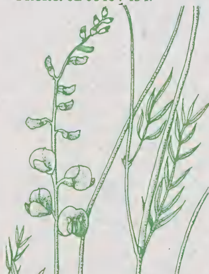
Swainsona recta .

Drawing by Diana Boyer, from the collection of the Australian National Botanic Gardens